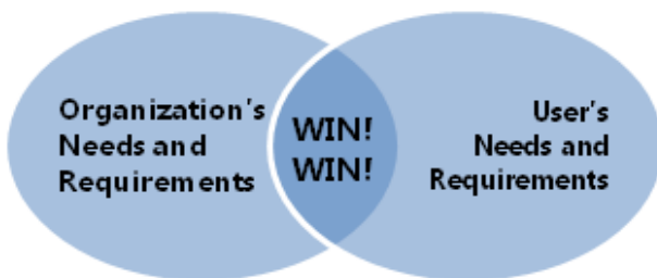
Fig 3. Using Microsoft Dynamics CRM Lets You Increase the Size of the Middle Ground

Another reason for failure is that the system ultimately deployed doesn't solve the employee's real problem, so they don't use it. Having Microsoft CRM as your platform allows developers to focus on solving the employees' problems and solving them well, so that they choose to use your application and thereby enter the information the organization requires to meet its needs.